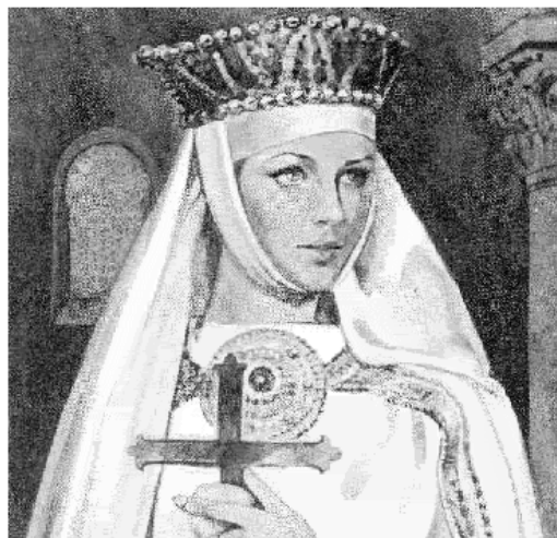
Saint of the Month St. Margaret of Scotland June 10

"Thank you" to all those who financially support the mission of St. John Parish. St. John's community totals 992 families.